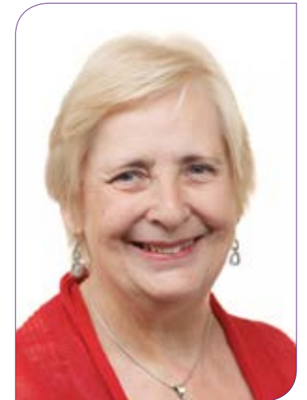
Gwenda Thomas AM Deputy Minister for Social Services