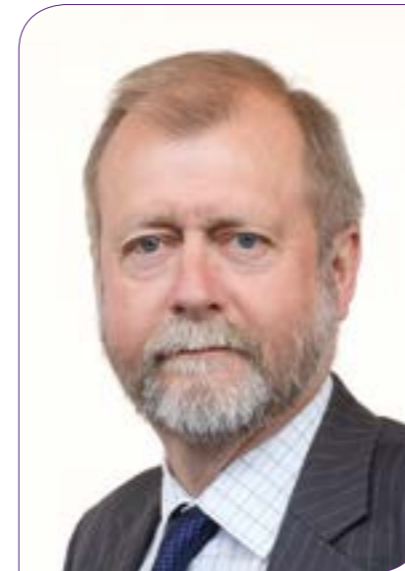
Jeff Cuthbert AM Minister for Communities and Tackling Poverty

However, we believe that the current climate makes it more important than ever that we continue to drive forward this agenda. Supporting people to live their lives in the way that they choose is the right thing to do. We must all do our best to ensure that we develop person-centred policies and programmes, and adopt an outcomes-focused approach to service delivery, nationally and locally.